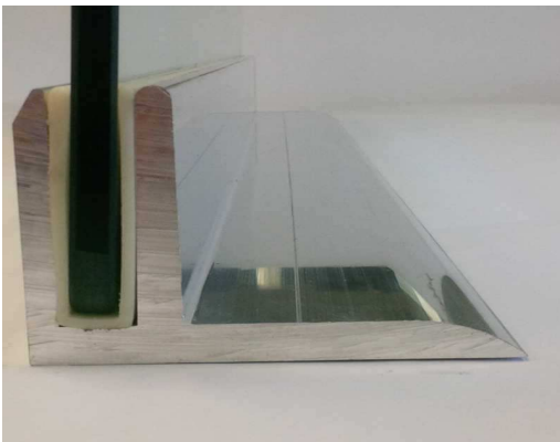
ANODIZED ALUMINUM L-SHAPED MOUNTING CHANNEL