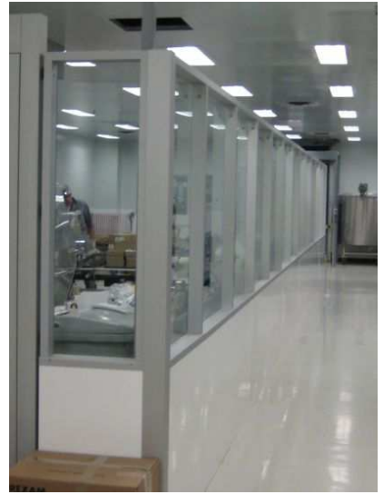
Valeant, Laval, QC

For more possibilities, contact us today. We are always creating something new in our line of Custom Enclosures!