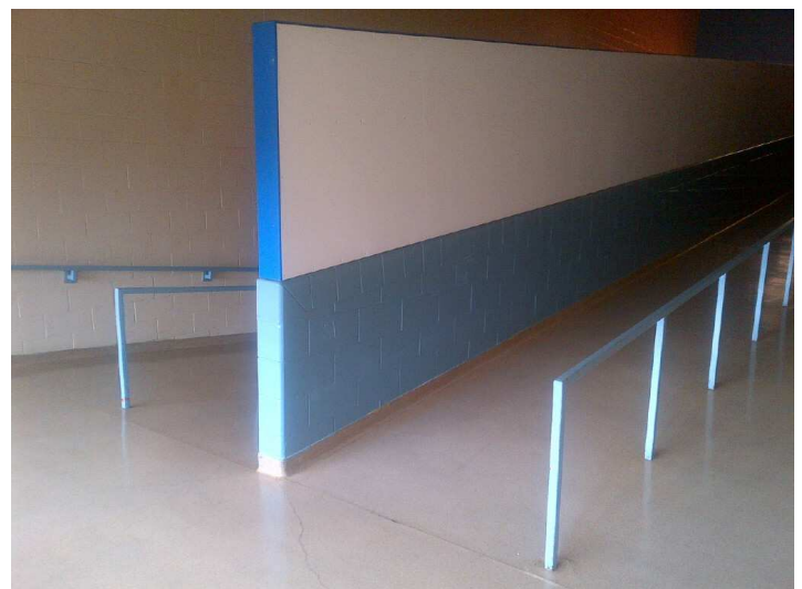
Victor Davis Recreation Centre, Guelph, ON