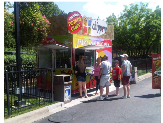
Chippery Kiosk Valley Fair, Shakopee, MN

And, if required, some of our Custom Enclosures products can be built for approval in clean room and fire-rated applications or with insulation for sound protection as well.